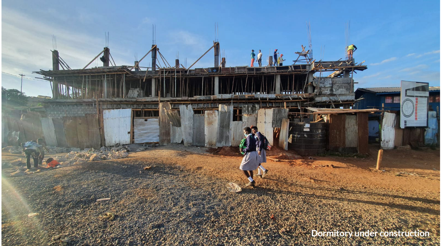
Dormitory under construction